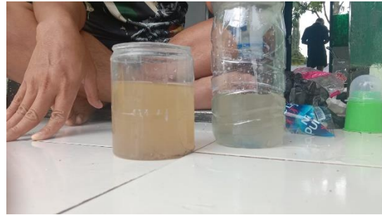
Image 11. The difference before and after going through the filtration process.

The table above is the result of the measurement of measuring instruments where the comparison parameters use Permenkes No. 416/Permenkes/IX/1990.